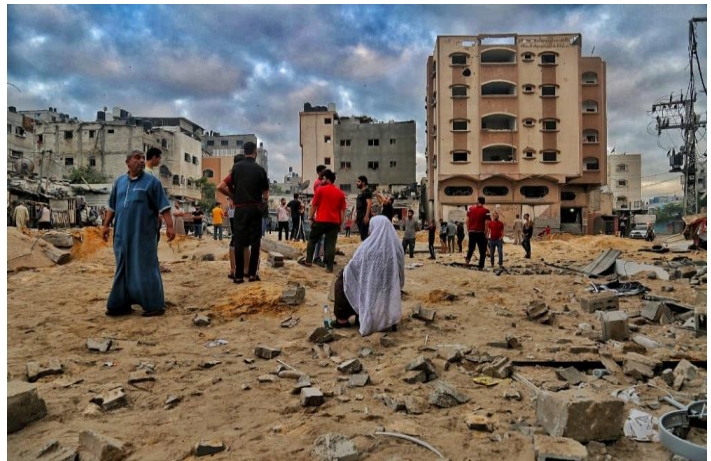
Destruction in Gaza following Israeli strike May 2021

At the height of the escalation, 113,000 displaced people sought shelter and protection at UNRWA schools and hosting communities. This has decreased to around 8,500 people, primarily those whose houses were destroyed or so damaged as to be uninhabitable. According to local authorities, over 2,000 housing units were totally destroyed or severely damaged.