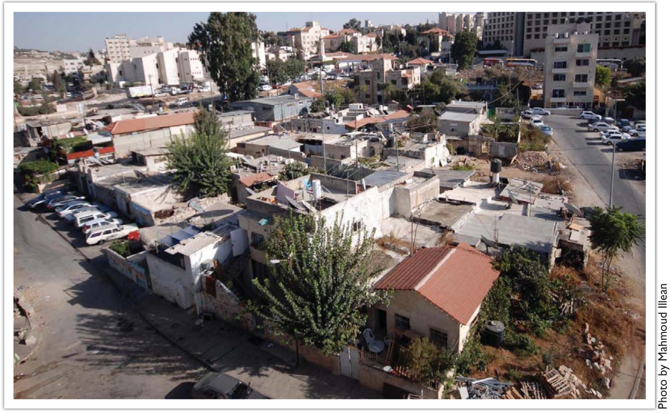
Kubaniyat Im Haroun, Sheikh Jarrah Sep 2010