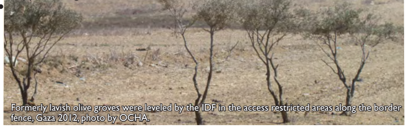
Formerly lavish olive groves were leveled by the IDF in the access restricted areas along the border fence, Gaza 2012, photo by OCHA.

The large majority of the olive trees that existed in areas within 1.5 km from the perimeter fence were destroyed in recent years by the Israeli military. Farmers refrain from replanting these areas due to the weekly leveling incursions and the risk of receiving 'warning shots' when approaching the area.