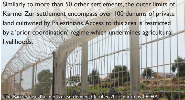
The Barrier near Karmeil Zur settlement, October 2012

Similarly to more than 50 other settlements, the outer limits of Karmeil Zur settlement encompass over 100 dunums of private land cultivated by Palestinians. Access to this area is restricted by a 'prior coordination' regime which undermines agricultural livelihoods.