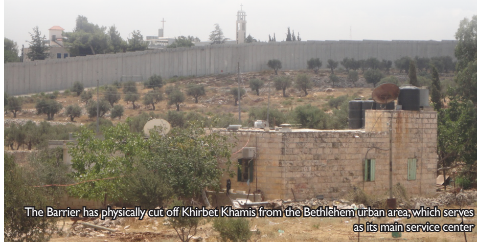
The Barrier has physically cut off Khirbet Khamis from the Bethlehem urban area, which serves as its main service center

Despite their alleged "illegality", residents were able to live in their homes undisturbed and to access surrounding