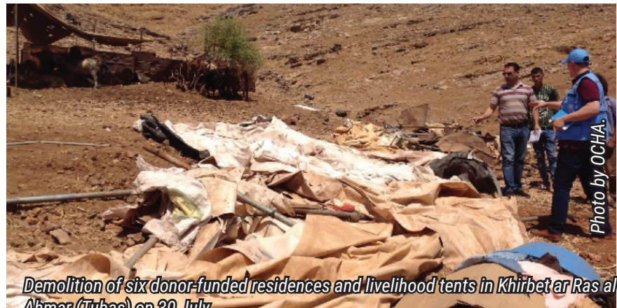
Ahmar (Tubas) on 30 July.