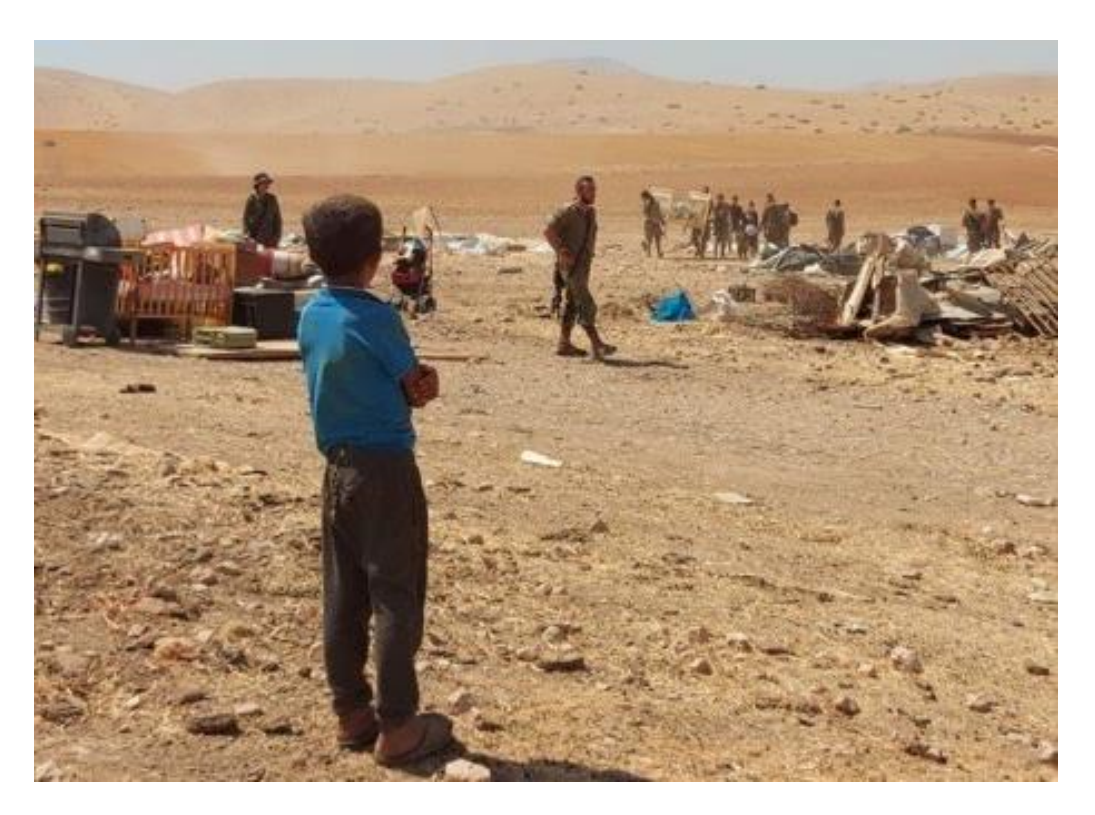
Palestinian boy looks on as Israeli soldiers destroy and confiscate residents' belongings in Humsa – Al Bqai'a, 7 July 2021.

For additional information on the deteriorating humanitarian situation in Humsa - Al Bqai'a, please see the previous six Flash Updates.